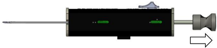
2. Pull the charging arm back firmly to cock the gun