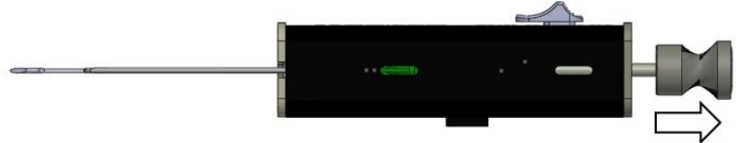
4. Pull the charging arm back half way to expose and fix the specimen notch for removing biopsy specimen

Note: These instructions are NOT meant to define or suggest any medical or surgical technique. The individual practitioner is responsible for the proper procedure and techniques to be used with this device.