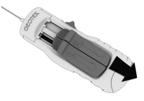
(II) Pull the button#2 backward firmly

6. Introduce the needle to the patient and advance to the biopsy site